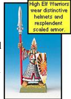
High Elf Warriors wear distinctive helmets and resplendent scaled armor.

The High Elves are one of the most ancient and civilized of all the races that populate the Warhammer World. From their island home of Ulthuan the High Elves have sailed and explored more of the known world than any other race - from as far afield as Norsca and Cathay.